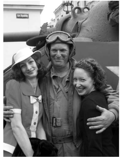
JIPPY-KAY-YAY ! ... and usually ... the tankers get the girls.