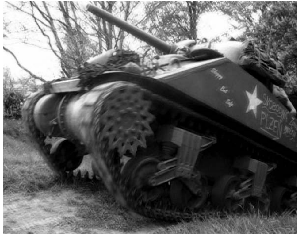
,Sloppy but Safe' looking for a nice parking spot ...