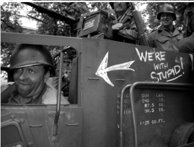
... no comment ...

SNAIL ATTACK THE FUEHRER'S LAST SECRET WEAPON Pvt. Shortwood beeing attacked by Nazi brain sucker snails. The snails eventually died of starvation.