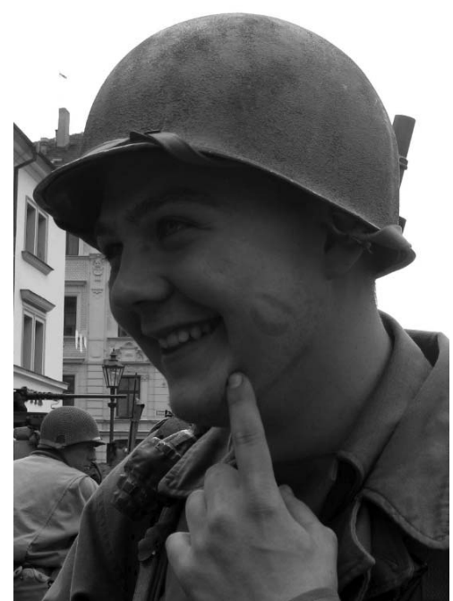
WOW I won't wash my face for the next five years.