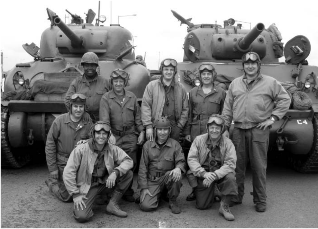
Sherman reinforcements from France, ready for parade