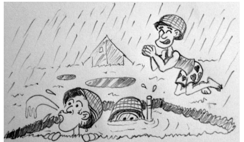
Cartoon drawn by T5 Photographer Rick van Nooij, 166th SPC.