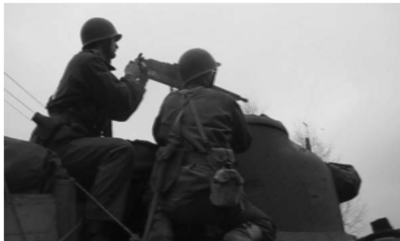
Sherman in quick advance.