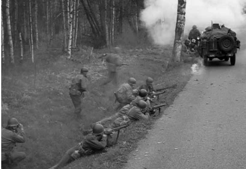
Infantry attacks German positions.

When early yesterday afternoon elements of the 16th Armored Infantry Division reached the outskirts of Strazny, once again, as so many times before during those past few days, they met stubborn resistance by scattered fanatic SS and Wehrmacht troops. After a short preliminary skirmish it soon became clear to higher command levels that heavy armor would be necessary to eliminate the well built German fortifications. As already reported yesterday, unexpectedly swampy terrain caused two M8s to bog down, but the Sherman which was also present and still on hard surface, finally managed to break through and knock the German anti tank positions out. Afterwards, Infantry mopped up the area and took sev-