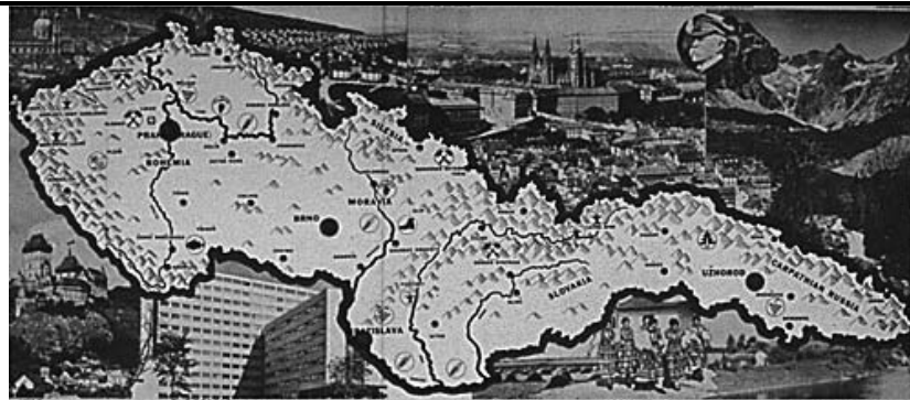
Map of Czechoslovakia. (US Army Signal Corps, Pictorial Service)

The captured German weapons included amongst others two anti tank guns. Thanks to the quickly available reinforcements supplied by the 8 th Tank Battalion the enemy strong points were knocked out effectively. The armored Infantry following the tanks was able to break the last pockets of resistance and round up a large number of German prisoners.