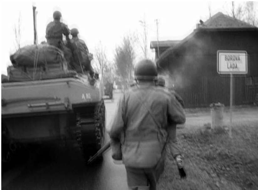
American Troops reach the border of BOROVA LADA. (US Army Signal Corps, Pictorial Service)