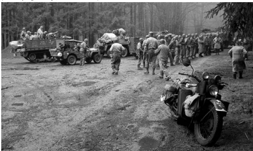
Armored Infantry is preparing for attack.

Strazny May 5. Czechoslovakia is about to be liberated! The swift advance of the 4 th Armored Division once again led to the liberation of large stretches of former enemy occupied territory. Elements of the 25th Cav. Regiment liberated the towns of Borova-Lada and Kvila.