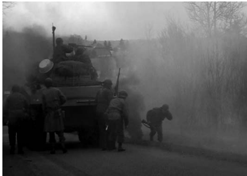
Infantry and tanks attack German positions.

sides still have to die, while it should be clear by now that this war will be over within only a few days.