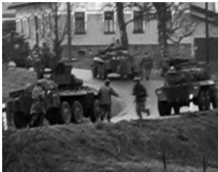
Tanks entering the village BOROVA LADA.

Division S-2 was able to secure valuable information on enemy positions and are analyzing them now.