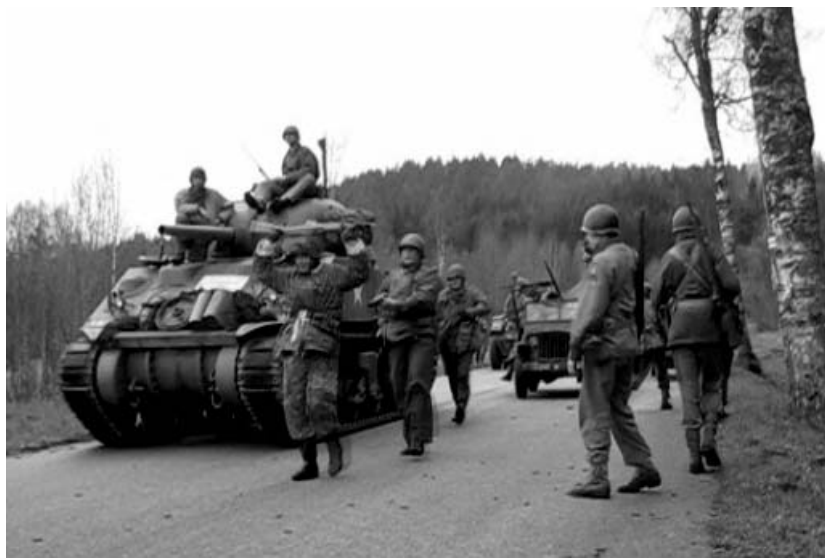
German prisoner.