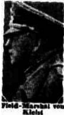
Field-Marshal von Kleist

The man who planned the invasion of Poland, Field-Marshal Paul von Kleist, has been captured by the U. S. 3rd Army. Aged 64, he was one of Hitler's foremost panzer commanders until he fell into disfavor. In the campaign in Russia his forces swept across Ukraine and deep into the Caucasus. The principal Soviet oilfields were almost in his grasp when the Soviet counter-offensive turned the tide. When he surrendered yesterday von Kleist was accompanied by his frightened wife, who had 25 pieces of baggage. Von Kleist said he wanted to be spared the embarrassment of being captured "in the presence of common retreating German" -AAP.