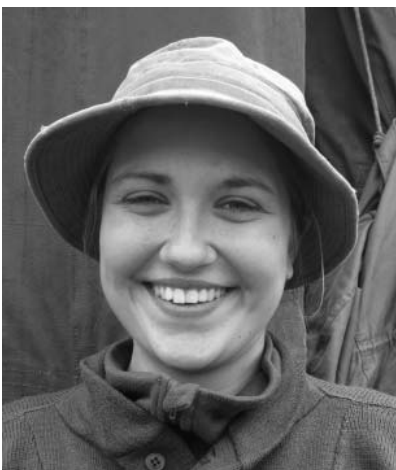
Dorothy (US Army Signal Corps, Pictorial Service)