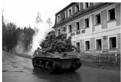
Sherman Tanks with Infantry