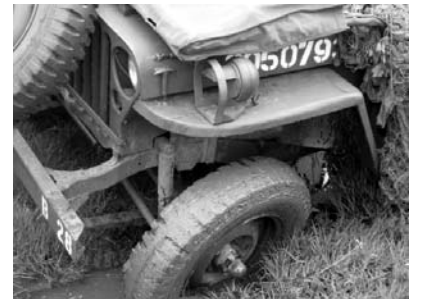
What a Mess (US Army Signal Corps, Pictorial Service)