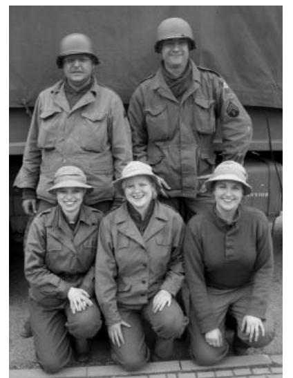
The Kitchen Team