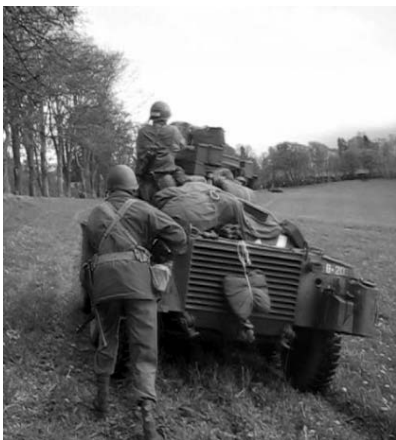
Armored Cars and Infantry attacking Kasperske Hory