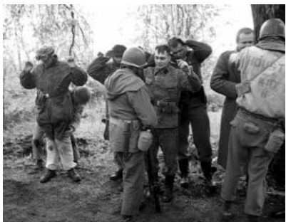
Prisoners taken in Kasperske Hory

The 1st Sgt grabbed the German officer and shouted that he will make him personally responsible for the killing of our men. The scared expression in the Hun's face will go down in history. And so the day ended with another victory for our troops. Let us all remember the men who died for our freedom!