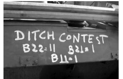
The 4 th Armored Ditch Contest.