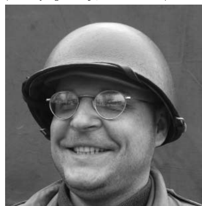
David (US Army Signal Corps, Pictorial Service)

When the combat teams arrive at the camp site the kitchen crew is already hard at work preparing a full and freshly cooked dinner for the men. Warm food is what the frozen men need once they climb out of the fighting vehicles. What awaits them is home style cooking at its best! Cooked meats, soups, fresh vegetables and sweet