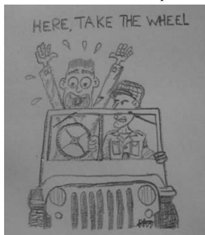
Cartoon drawn by T5 Photographer Rick van Nooij, 166 th SPC