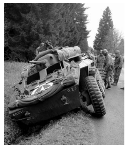
M8, B 22 in the Ditch