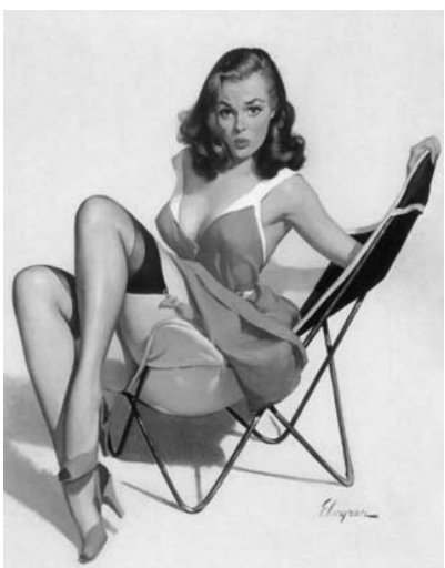
Miss Kasperske Hory - MAY 1945