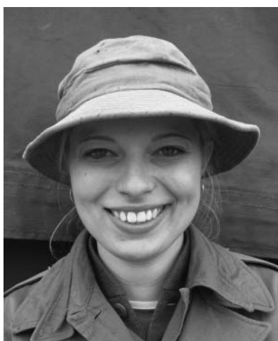
Jane (US Army Signal Corps, Pictorial Service)